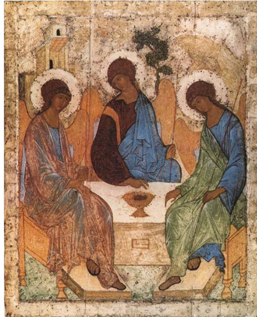
Andrei Rublev, The Holy Trinity