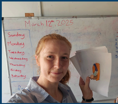
All set for English class