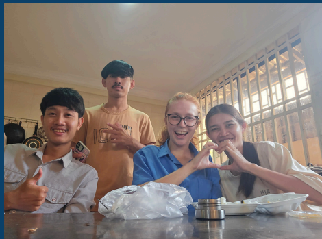
Nham bai! - Eat rice!