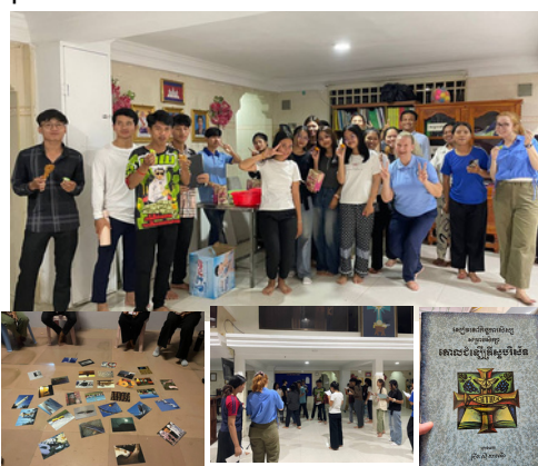
Picture cards in action - Ice breaker activity - Small Catechism Workbook

When I arrived at the dorm, residents had meetings every Tuesday and Friday. Now, we only meet on Tuesdays which I think is better for the busy students. Most Tuesdays, we study the Small Catechism with the Bishop, but on the last Tuesday of the month we meet in small groups to talk about building community in the dorm. Church members and partners who have been trained in PSS(psychoeducation social support) by FELM lead these groups. It’s